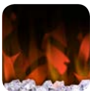
White Cube/ Red Flame