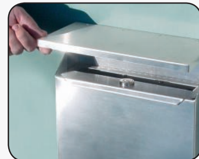
#4520 with optional security kit (#4521) displayed